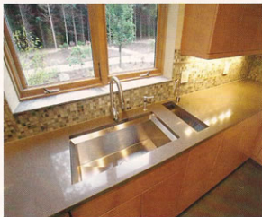
Caesar stone countertops and a glass tile back splash add subtle elegance to the kitchen.