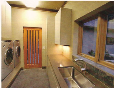
An efficient and contemporary laundry room.

The house is amazingly well landscaped, including a waterfall and a stream running under the front walk. Lilac slate steps are cantilevered to look like they are floating. “We bring the outside in with the same lilac slate in the foyer, just inside the beautiful double front door.” The outside entrance has a cathedral ceiling supported by columns.