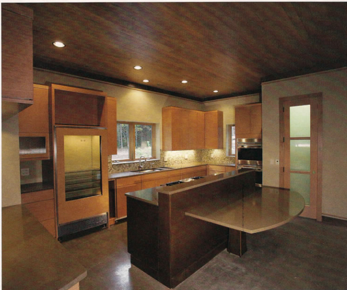
Upscale kitchen with quartz countertops and Sub Zero fridge add to the punctuality

From the slate floor entry, you can look directly across to the beautiful fireplace clad in raw steel. To the right a three-season room is incorporated into the space, again bringing the outside in. The kitchen to the left has a glass tile back splash, Caesar stone counter tops, and cabinets made of rift cut oak in two tones of chocolate and natural. This cabinet style and these two tones carry through out the house.